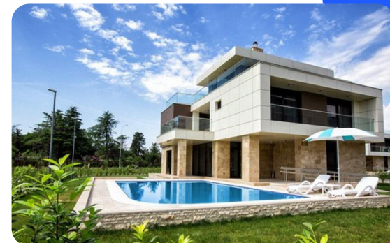
Villa Radisson Collection Paradise Resort & SPA, Sochi 5*