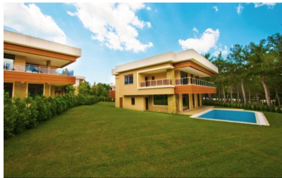
Villa Metropol Grand Hotel Gelendzhik 5*