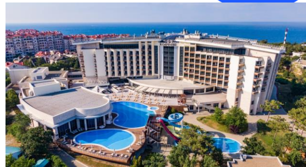
Metropol Grand Hotel Gelendzhik 5*