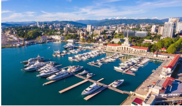
The historical center of Sochi