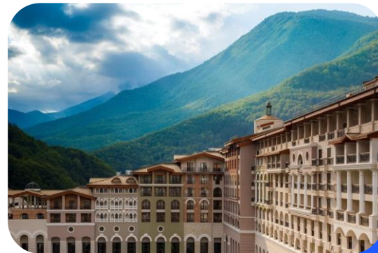
Sochi Marriott Krasnaya Polyana 5*