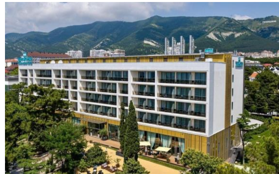
Primore Grand Resort Hotel 5*