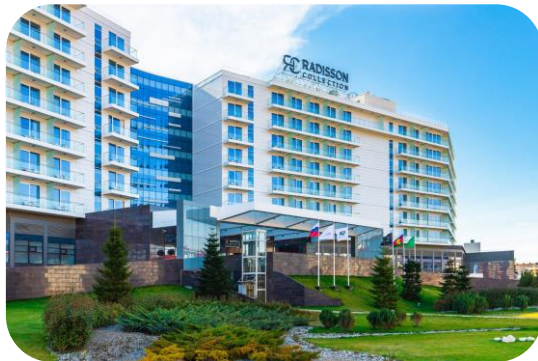
Radisson Collection Paradise Resort & SPA, Sochi 5*