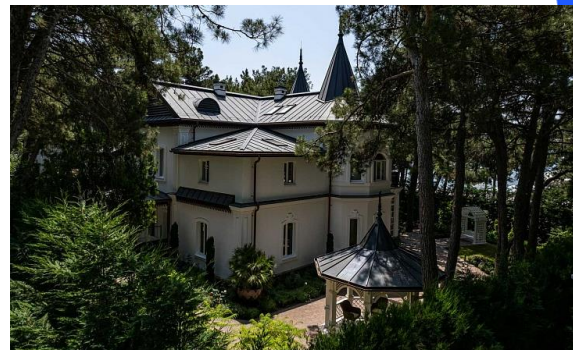
Villa Primore Grand Resort Hotel 5*