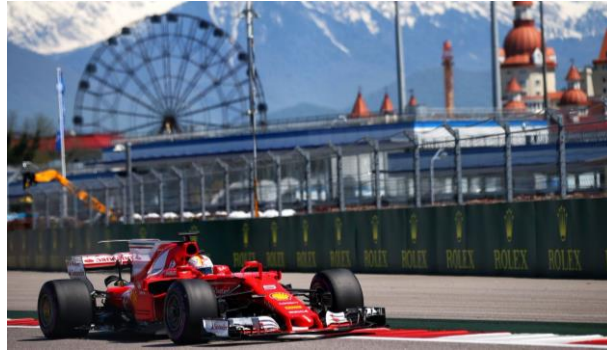
Formula 1 Sochi