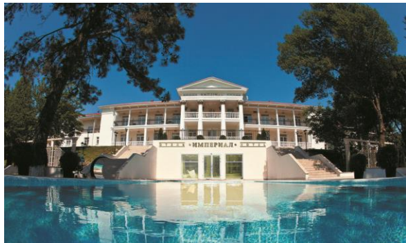
Imperial & Champagne-spa 4*