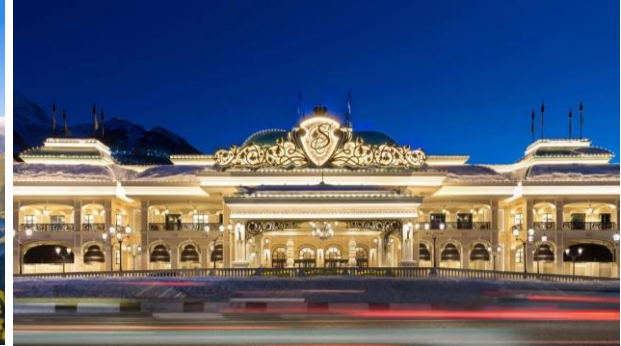
Krasnaya Polyana Casino