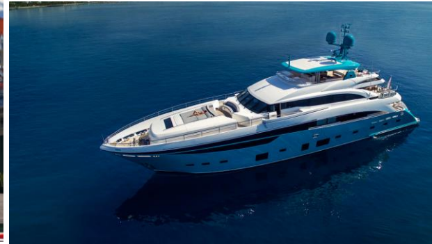
Sochi from the sea