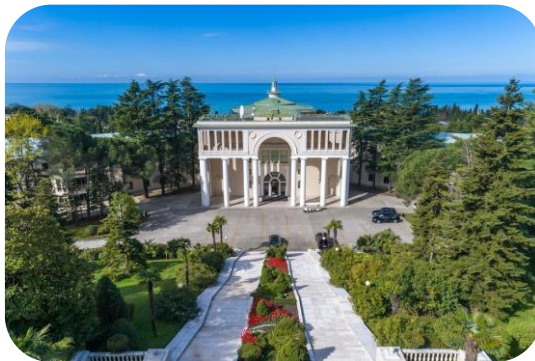
Rodina Grand Hotel & SPA 5*