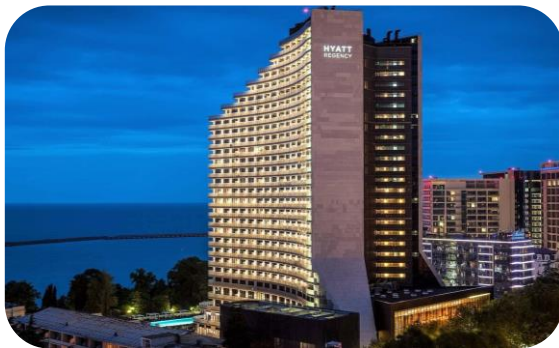
Hyatt Regency Sochi 5*