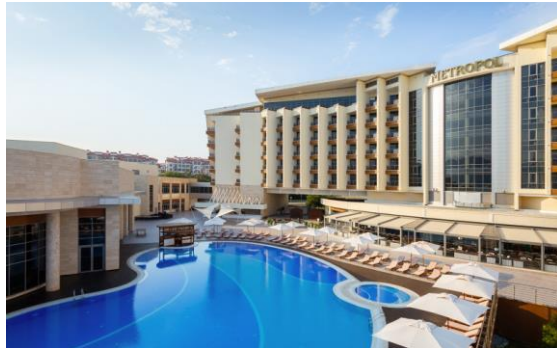
Metropol Grand Hotel Gelendzhik 5*