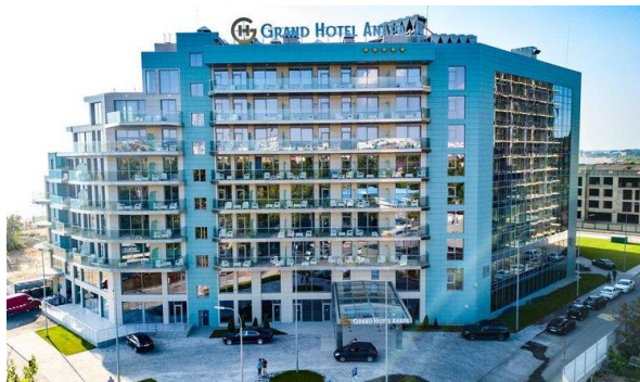
Grand Hotel Anapa 5*